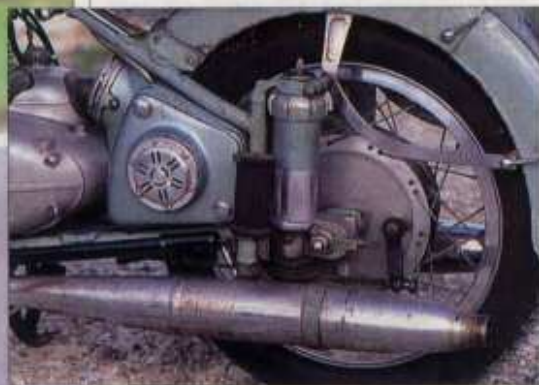
Plunger suspension is sophisticated, with hydraulic damping and adjustment for load.

Guide price now As few as five complete Adler twins may remain in Britain. They rarely appear for sale in Germany. So if you're looking for an MB250 Adler, be prepared for a long search.