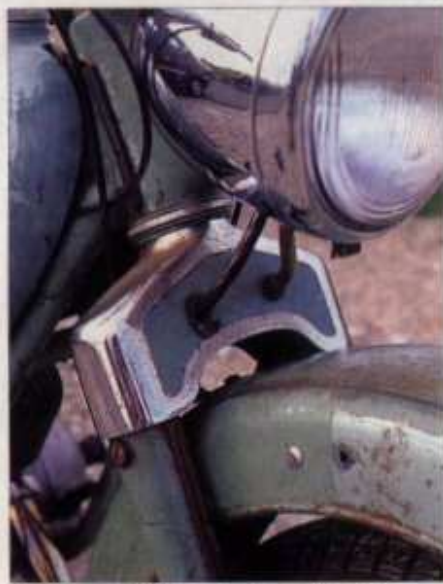
Owners of Ariel two-strokes will spot the similarity of front fork treatment.

Londoner Bernie Stevens owns a 1954 247cc MB250 twin. Now delivering the milk in rural Sussex, Bernie is a devotee of Fifties German motorcycles, remarking that he has always been attracted by the quality of their design and manufacture. The design detail on the Adler is indeed astonishing when compared with contemporary British motorcycles. Good examples are the neatly mounted horn — it's in the outer cover of the battery box — and the handlebar lock in the centre of the steering damper knob. Better still, the toolbox hinges down from the frame to reveal a concealed, and locked lid. Once this is