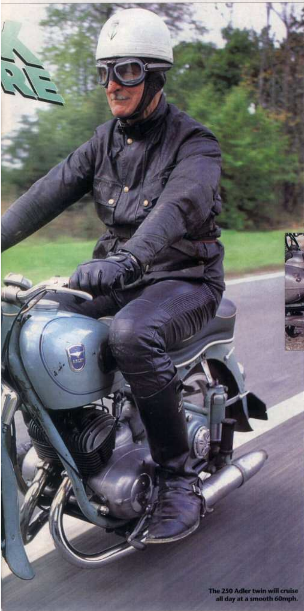
The 250 Adler twin will cruise all day at a smooth 60mph.