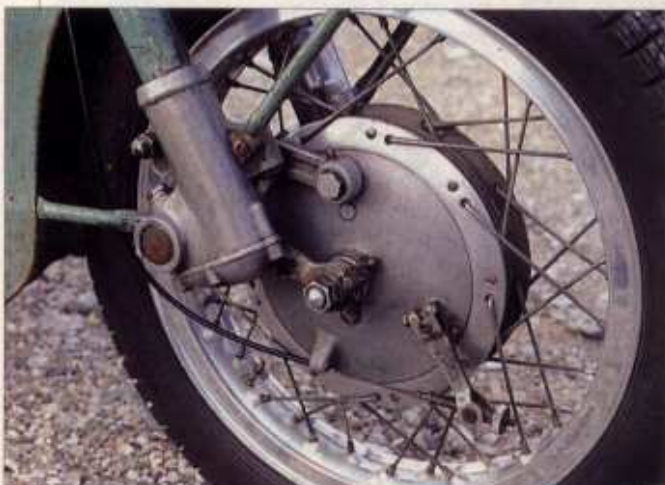
Leading link front fork with large 180mm full-width hub brake.