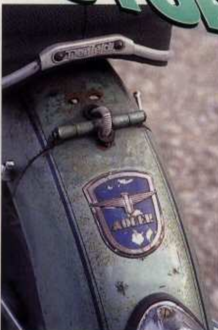
Rear mudguard hinges up to release rear wheel: note armoured wiring over hinge.

In 1957 Adler, along with Triumph (TWN) of Nürnberg, were bought by Grundig, Germany's largest producer of radios and televisions. Grundig stopped motorcycle production, concentrating their office machinery output at the two factories. Adler motorcycles were once again ousted by typewriters, as they had been in 1907. The soaring eagle had landed for good — in the office, where the quality of Adler design was still recognised as second to none. ■