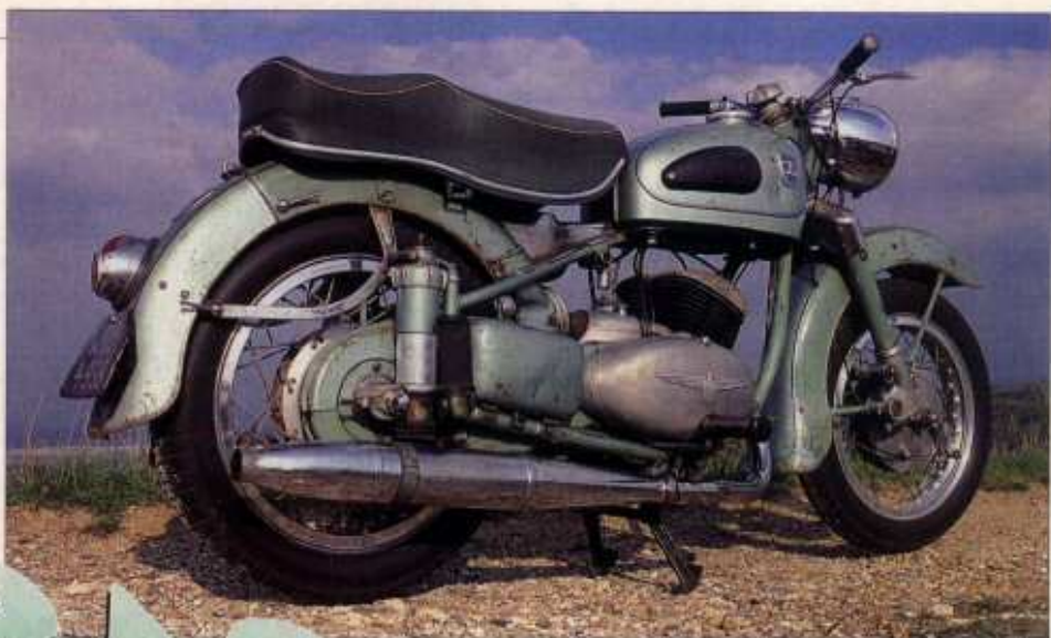
A sporting engine, but the mudguards are deeply valanced and the final drive chain is fully enclosed: typically German.

Excellent handling is a by-product of the low centre of gravity, resulting as it does from the small wheels and limited travel suspension. It was not long before I grounded the centre stand on a left-hand corner. The sus-