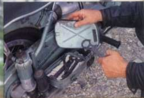
Adler toolbox hinges down to reveal a concealed lockable lid — good thinking.